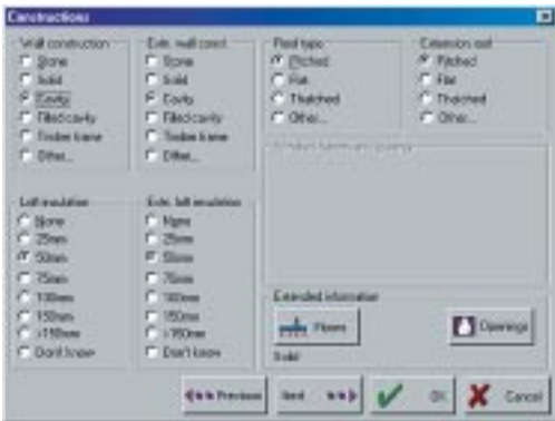
Data input for quick energy assessments